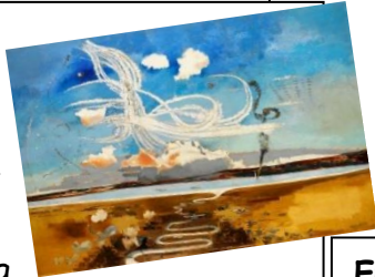
Battle of Britain seen here.

We will look at Blitz artwork, particularly focusing on the artist Paul Nash and perspective in drawing.