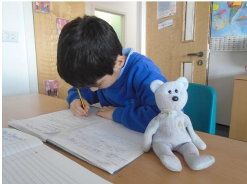
Writing a letter