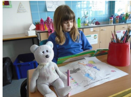
Locating places in France