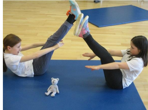
Practising Gymnastic Skills