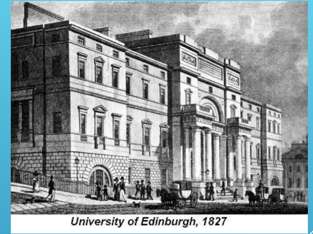
University of Edinburgh, 1827